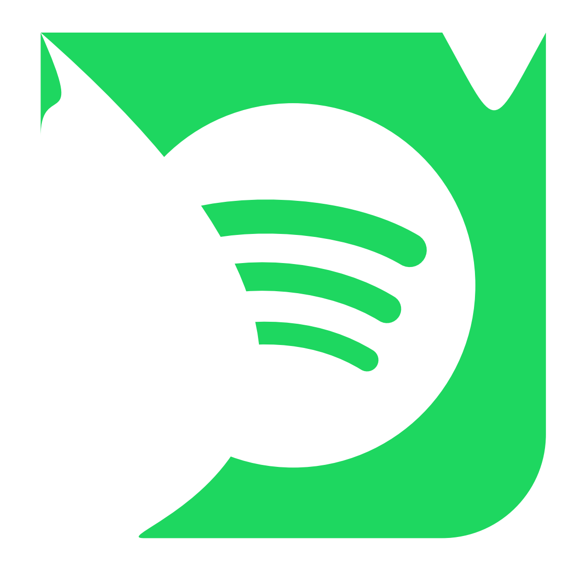
<?xml version="1.0" encoding="UTF-8"?>